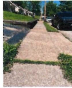
_____ Steep Cross Slope (sidewalk is not flat)