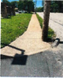
_____ Obstruction (utility poles, fire hydrants etc.)