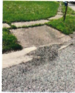
_____ Standing Water/ Debris (standing water, ice accumulates in winter)