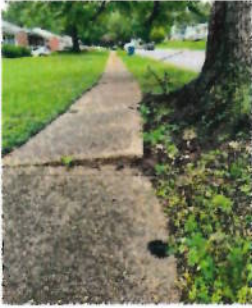
_____ Trip Hazards (uneven sidewalk panels)