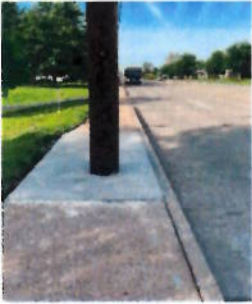
_____ Obstructions (utility poles, fire hydrants etc.)