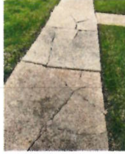
_____ Poor Surface Quality (broken sidewalks)