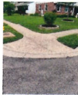
_____ No Detectable Warning Panels (bumps at the bottom of the curb ramp)