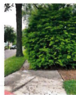
_____ Encroachment trees, bushes etc.)