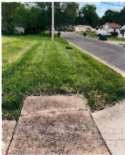
_____ Non-Continuous Sidewalks (sidewalk starts and stops)