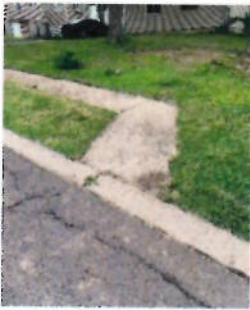
_____ No Curb Ramps (6 inch drop off the sidewalk)