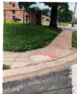
_____ Broken curb ramp (uneven walking surface)